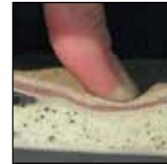
HAIX® MSL System